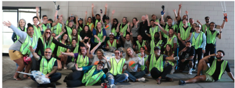
Various staff clean-ups across the globe