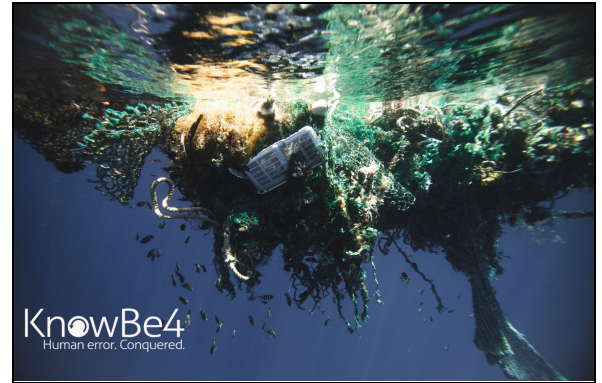
Garbage in the Great Pacific Garbage Patch

We protected endangered species through targeted donations, including 13 species in 2023 for our 13th anniversary (representing each country where we operate plus two additional species), and 14 different species in 2024 for our 14th anniversary through our tree planting initiatives.