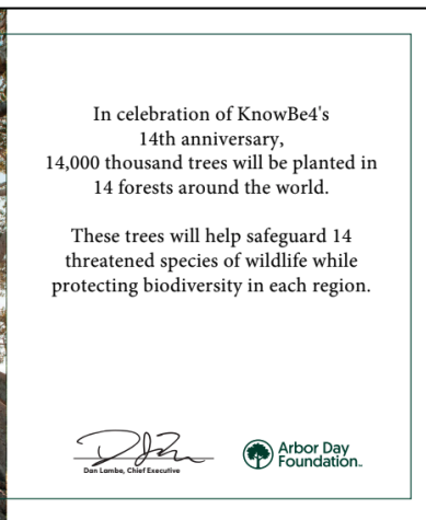
Arbor Day certificate