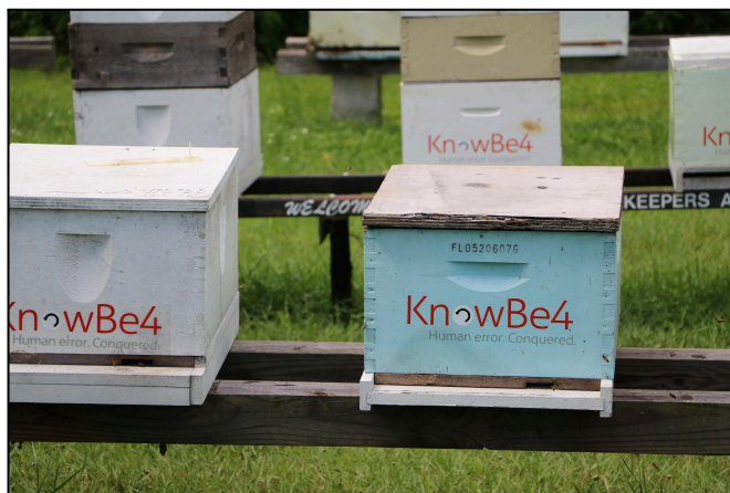
KnowBe4 Staff and hives at Pinellas Beekeepers Association