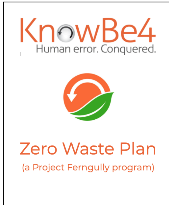
Image of Zero Waste Plan

We aim to achieve an 80% annual average diversion rate from landfill, incineration (WTE), and environmental disposal through waste reduction, reuse, responsible recycling, and composting.